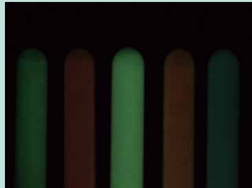
Standard Lens (Open Aperture)