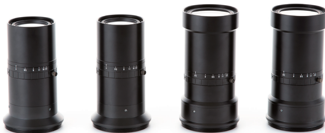
Image circle \phi 90mm High magnification models: 2.0x/2.5x/3.3x/5.0x

16K sensor support, high magnification line scan macro lens